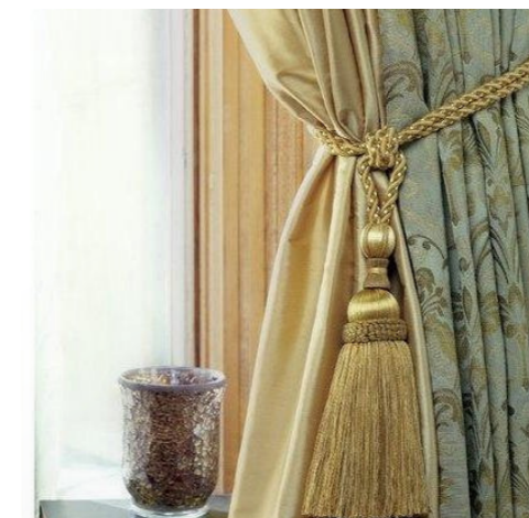
Trimmings & Embellishments